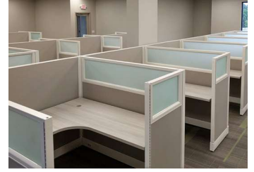
* ACCESS PANELS